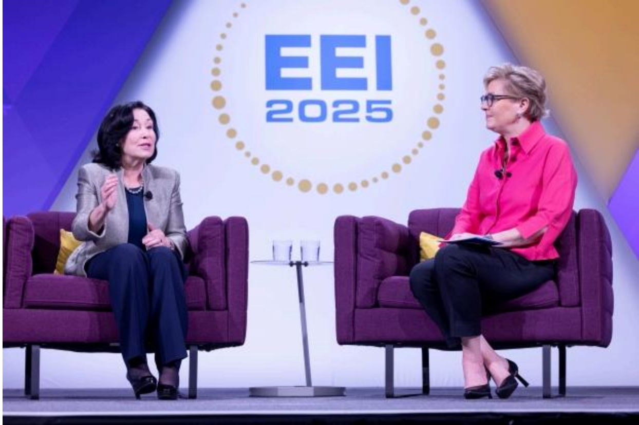
Safra Catz, CEO, Oracle, and Outgoing EEI Chair Maria Pope, President and CEO, Portland General Electric.